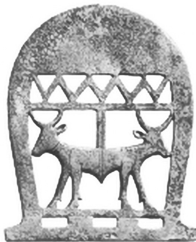
Figure 2. Bronze parade axe.

both Yahweh and his prophet Moses and return to Egypt to serve the Egyptians (and therefore the Egyptian gods as well). During the revolts at Rephidim and Kadesh Barnea the Israelites were on the verge of stoning Moses to death when Yahweh personally intervened and stopped the revolts. 12 At Mount Sinai the people went so far as to build an image of a twin-headed, golden bull, calling it Yahweh. 13 This idol was conceived out of pagan bull worship common in Baalism throughout the Middle East, the Apis and Horus bulls being part of the Baal ritualistic practice in Egypt from whence the Israelites had recently come. 14 An example of this type of idol was found on an axe head from Egypt dated to a period earlier than the XVIII Dynasty (see figure 2). 15